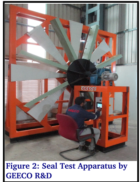
Figure 2: Seal Test Apparatus by GEECO R&D